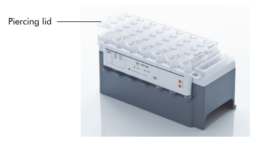
Figure 3. Easy worktable setup with reagent cartridges. The reagent cartridge with the piercing lid positioned in the reagent cartridge holder.

The reagent cartridge is then loaded into the "Reagents and Consumables" drawer.