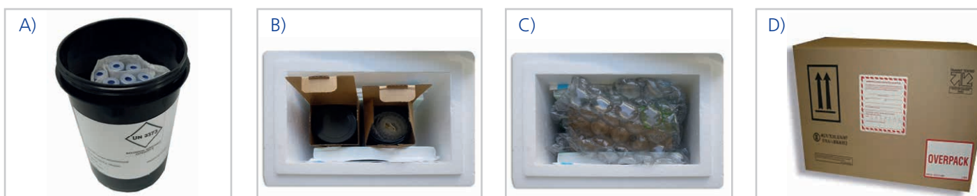
Table 1: Materials used for packaging according to IATA-compliant packaging instructions 650.

Figure 1: IATA-compliant packaging concept. Twenty (20) PAXgene Blood ccfDNA Tubes (primary receptacles) filled with blood were placed into a GBox 650 (secondary receptacle). One absorbent sheet was placed below and one on top of the tubes within the GBox. Additional absorbent sheets were wrapped around the tubes [A] . To measure the temperature profile, a datalogger was placed within the GBoxes on top of the blood tubes. Two (2) GBoxes were inserted into corrugated boxes (outer packaging) and then placed in the middle of polystyrene box. A cooling pack was placed on each side of the GBoxes [B] . Remaining space in the polystyrene box was filled with absorbent sheets and air cushion packaging foil [C] . Finally, the polystyrene box was placed into a large corrugated box (shipping box) and labelled appropriately [D] .