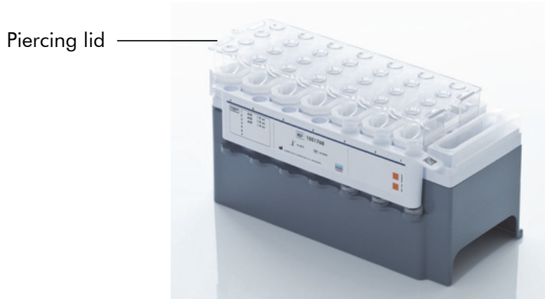
Figure 3. Easy worktable setup with reagent cartridges. The reagent cartridge with the piercing lid positioned in the reagent cartridge holder.

The reagent cartridge is then loaded into the “Reagents and Consumables” drawer.